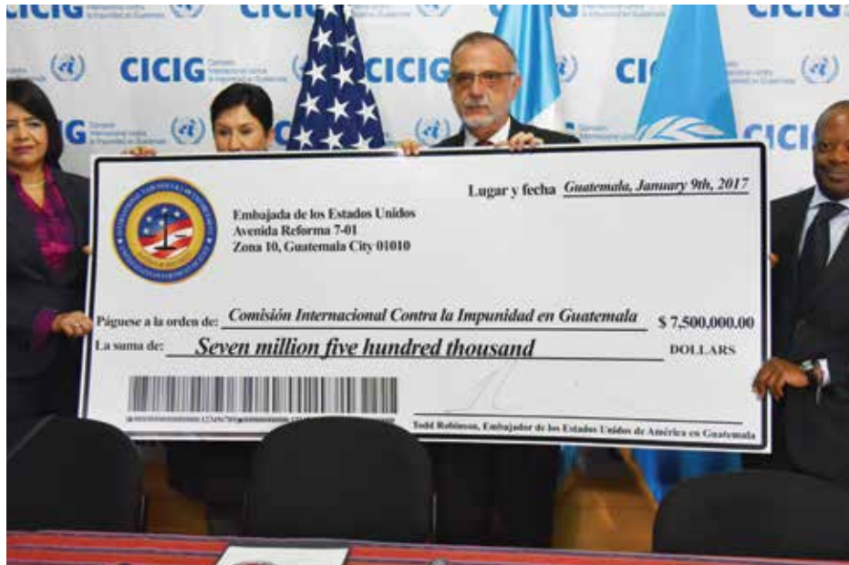
Donation for Comisión Internacional contra la Impunidad en Guatemala (CICIG)

in the other Northern Triangle states to begin improving the lawless environments in which gangs and corruption flourish.