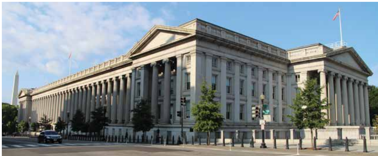
US Treasury Building