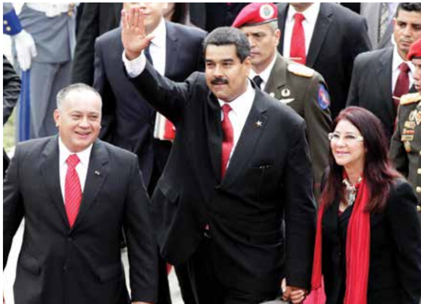
Diosdado Cabello, Nicolás Maduro, and Cilia Flores in 2013

Although the Venezuelan regime's complicity in narcotics trafficking has been alleged by opposition sources and regional media for years, the depth and breadth of the government's lawlessness was only revealed by the Wall Street Journal in a May 2015 article regarding ongoing US federal investigations into several high-ranking Venezuelan officials' involvement in cocaine smuggling: