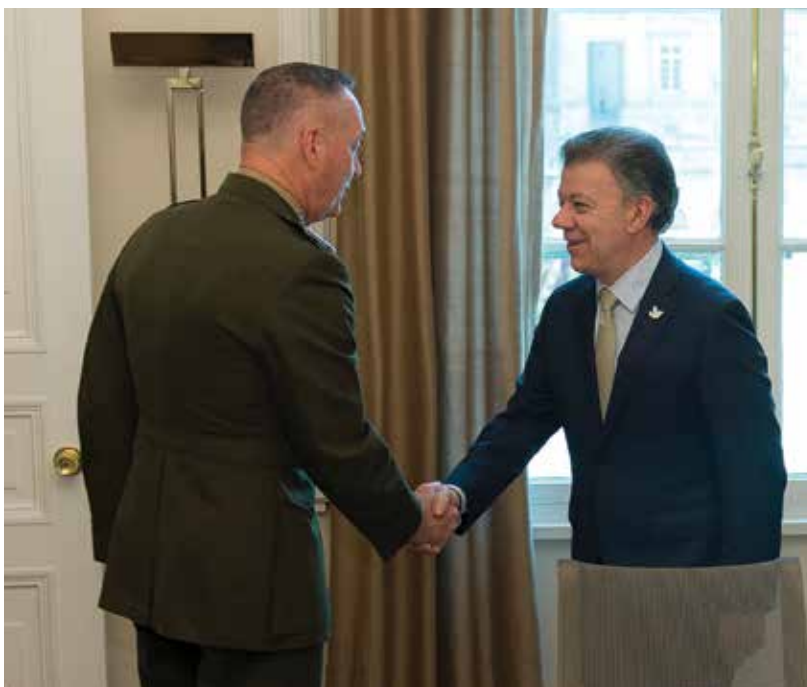
US Marine General Joseph F. Dunford Jr., chairman of the Joint Chiefs of Staff, meets with Colombian President Juan Manuel Santos in Bogota, Colombia, on March 10, 2016

Throughout much of the past century, Colombia has been plagued by illegal guerrilla forces and notorious cocaine cartels. Beginning in the mid-1990s, the FARC outgrew its traditional supportive role in the drug trade, metastasizing into one of the world's most powerful and multifaceted TCOs and thriving off the illegal drug trade, human trafficking, illegal mining, and other illicit activities. The FARC became the world's largest producer of cocaine, and Colombia's criminal structures have since become integral components of a global drug trafficking network that threatens the security and well-being of dozens of nations. Confronting this threat at its roots requires the political will of Colombia and the backing