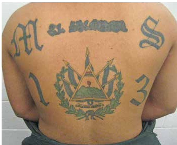
A typical MS-13 tattoo

There are multiple gangs in the Northern Triangle that hold varying levels of power and resources. By most measurements, the largest gang is Mara Salvatrucha (MS-13), while a gang known as Barrio 18 is considered its primary rival. Both gangs have internal divisions and varying local structure, but there are