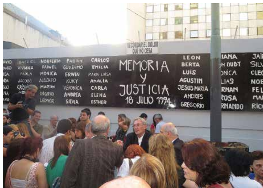
Each year, thousands of people gather in remembrance of the AMIA attack

Iranian diplomatic and cultural investment in Latin America has served it well in recent years. Iran's ability to evade US and international sanctions against its illicit weapons of mass destruction programs ranks among its most tangible benefits. Experts estimate that several sanctions-busting schemes with ALBA nations allowed Iran to access several billion US dollars through Latin American banking systems,