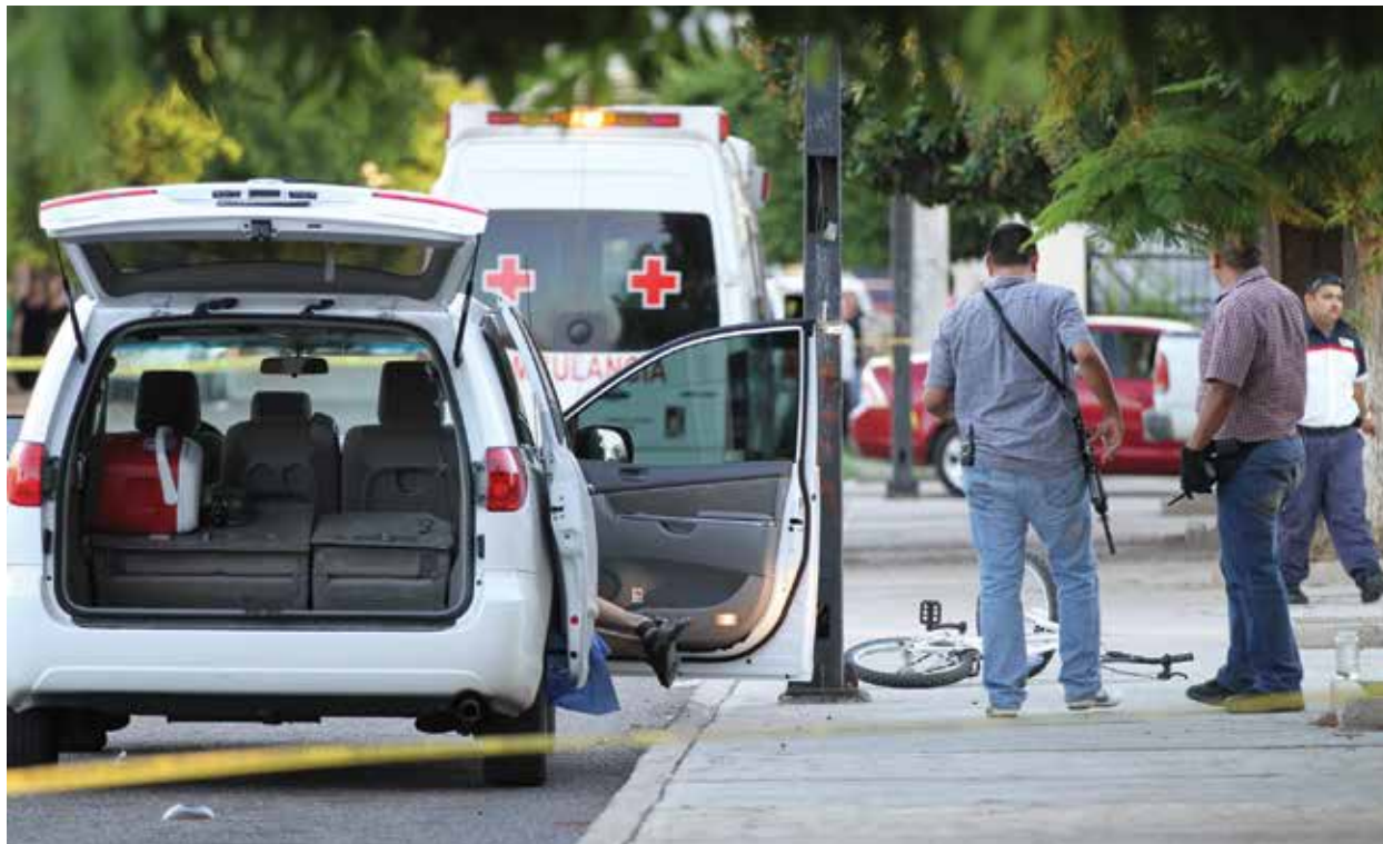
Police investigate a murder scene in Hermosillo, Mexico