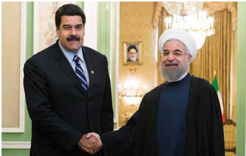
Iranian President Rouhani and Venezuelan President Nicolás Maduro in Saadabad Palace