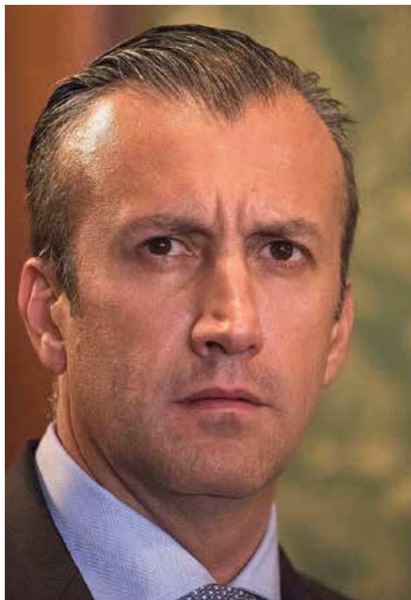
Tarek El Aissami in 2016