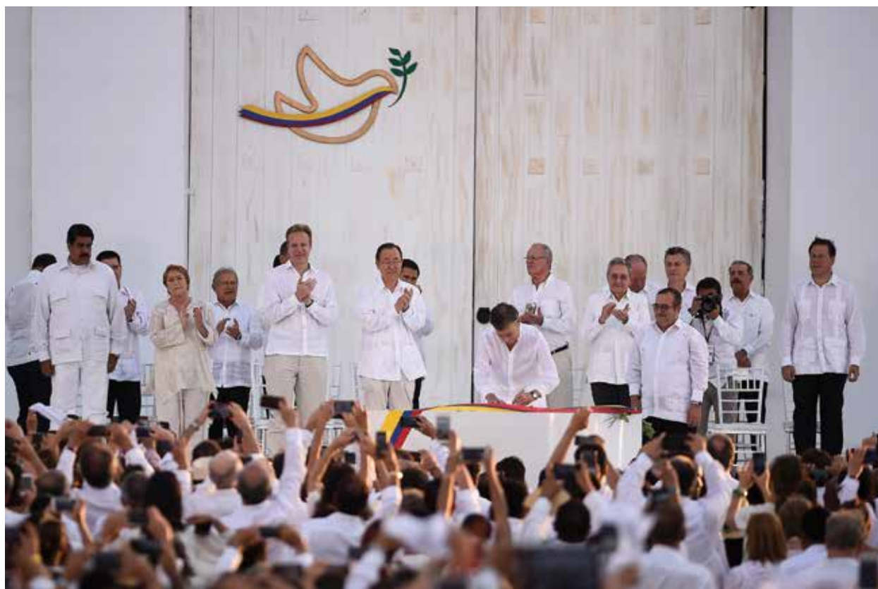
President Santos signs the peace agreement between the Colombian government and the FARC