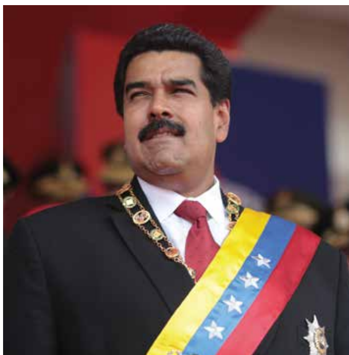
Venezuelan President Nicolás Maduro

This concentration of authority in the hands of an ideological cadre has coincided with a similar consolidation of control over economic activity, through the heavy regulation of imports, the politicized management of producing and exporting oil (the country's