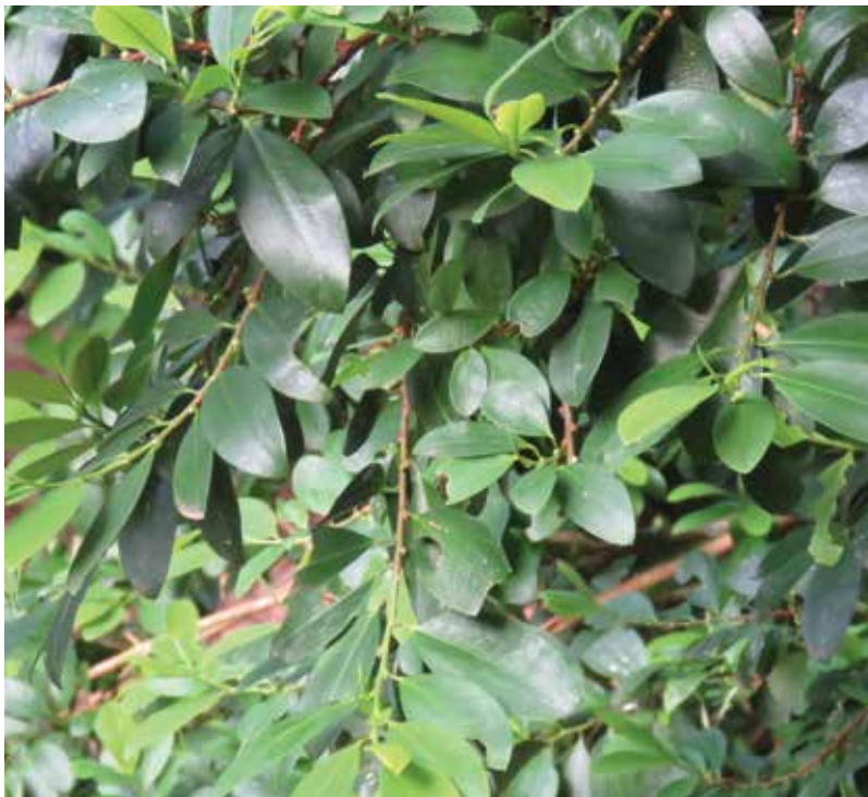
A coca plant

While the vast majority of the FARC's dissidents were expected to be absorbed into the ELN, the BACRIM, or one of the other criminal organizations in the region, it now appears that a significant group of FARC dissidents plans to remain independent from