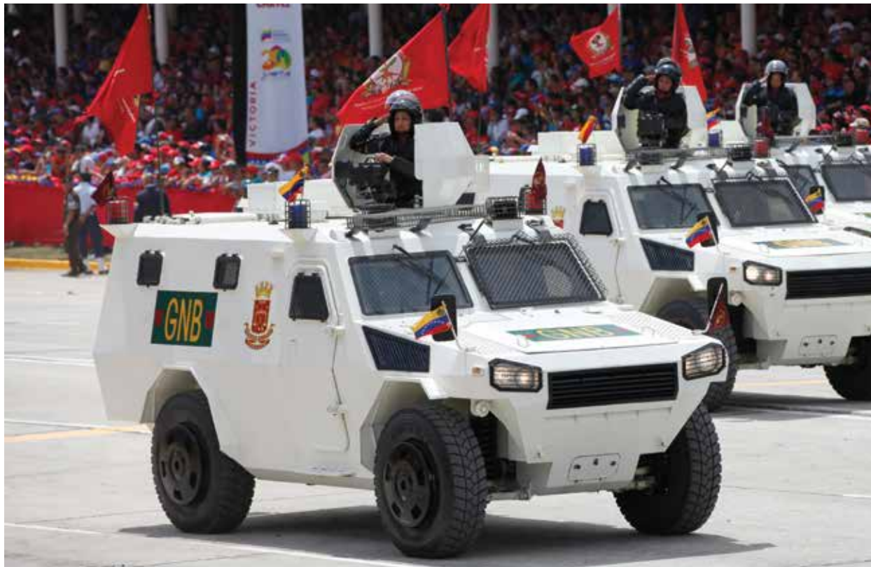
A Venezuelan National Guard VN-4