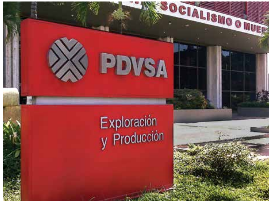
Entrance of the PDVSA headquarters in Maracaibo, Venezuela, with the phrase "Patria, Socialismo o Muerte" visible

Journalistic investigations into Albanisa found that as much as $4 billion was redirected for "privatization" from what was intended for social and