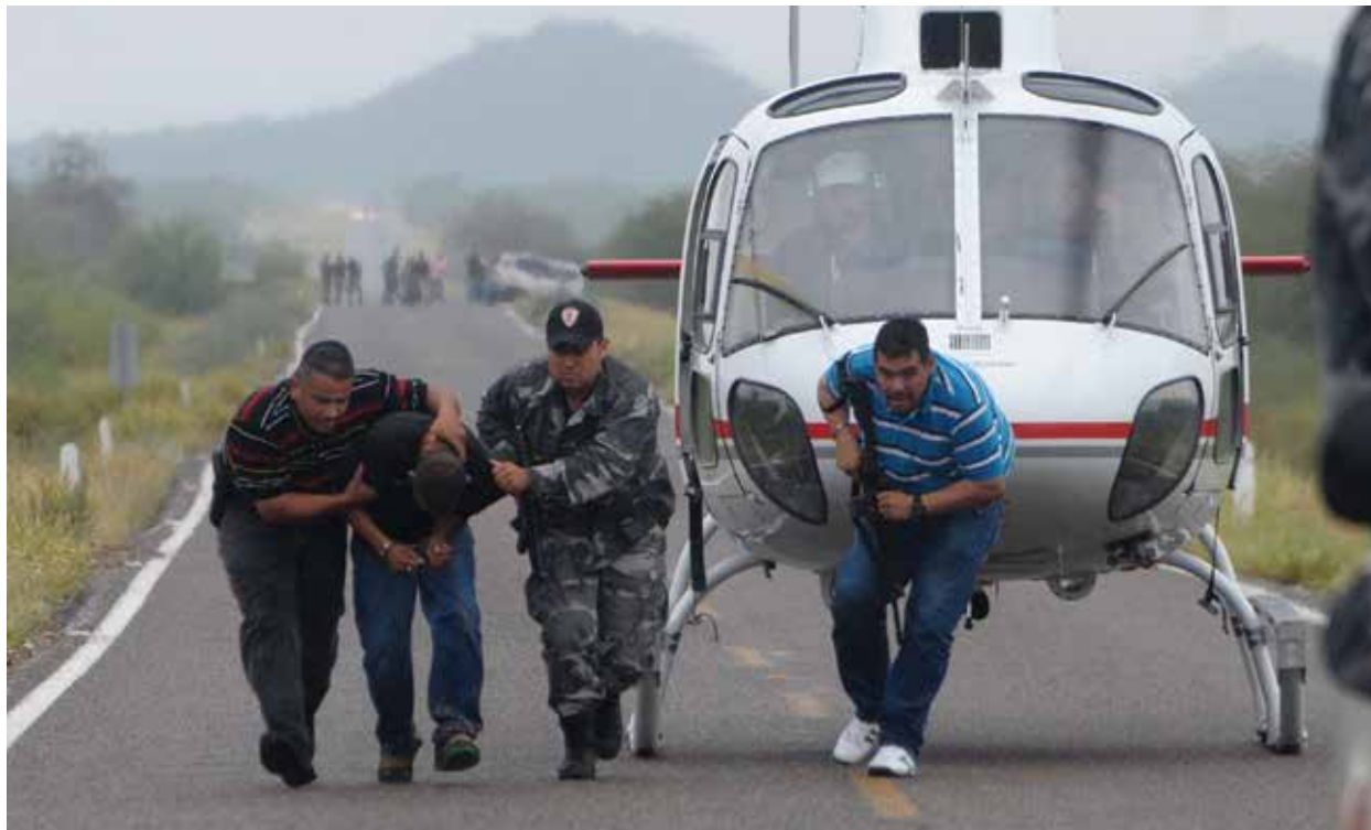
Police take a suspected drug trafficker off a helicopter in Hermosillo, Mexico