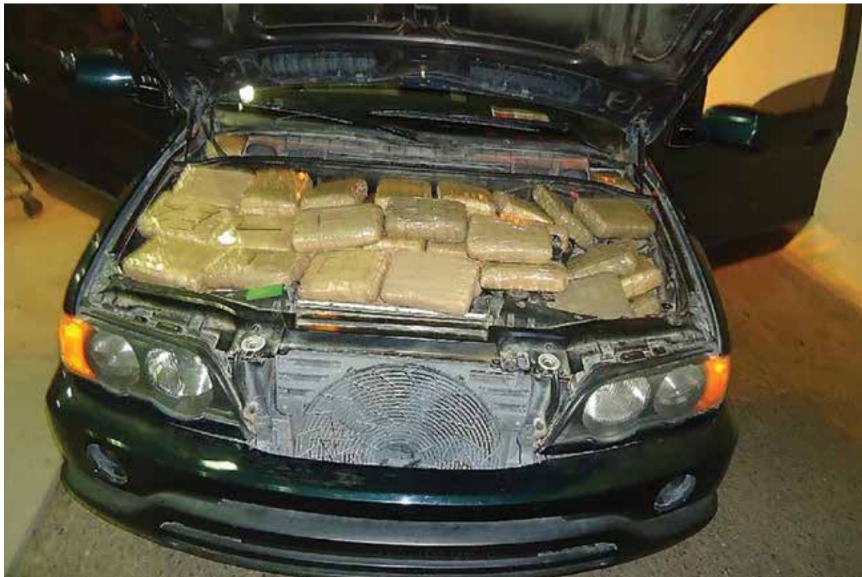
Customs and Border Protection discovered 240 pounds of marijuana, worth almost $120,000, concealed in a 2001 BMW